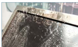
2. Rugged metal housing and NEMA 4 / IP 65 dust & water proof display front.