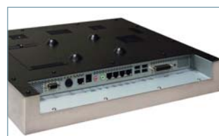
4. Rich I/O ports provide excellent peripheral connectivity.