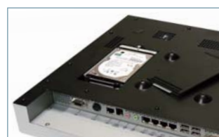
6. Slim HDD bay design for easy service.