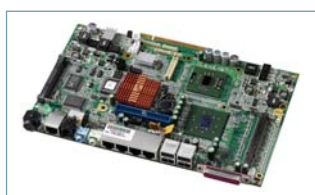
3. Intel mobile technology supports multiple processors from Fanless ULV CPU to high performance Celerm M, Core 2 Duo.