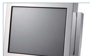
5. Accessories: MSR, External web cam kit