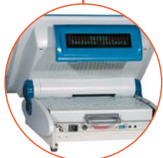
option for second hard disk