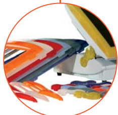
interchangeable clip kits