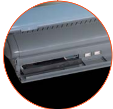
2 USB retail DVD and CD readers