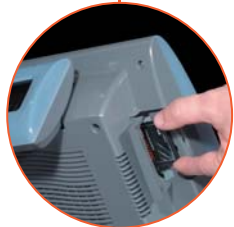
Compact Flash Card reader