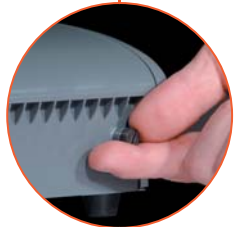
easy access to disk(s), without any tool